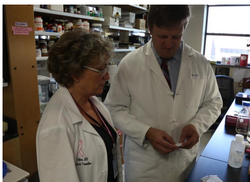
Komen Promise Grantees at the University of Kansas and the University of North Carolina are testing flaxseed for the prevention of breast cancer.